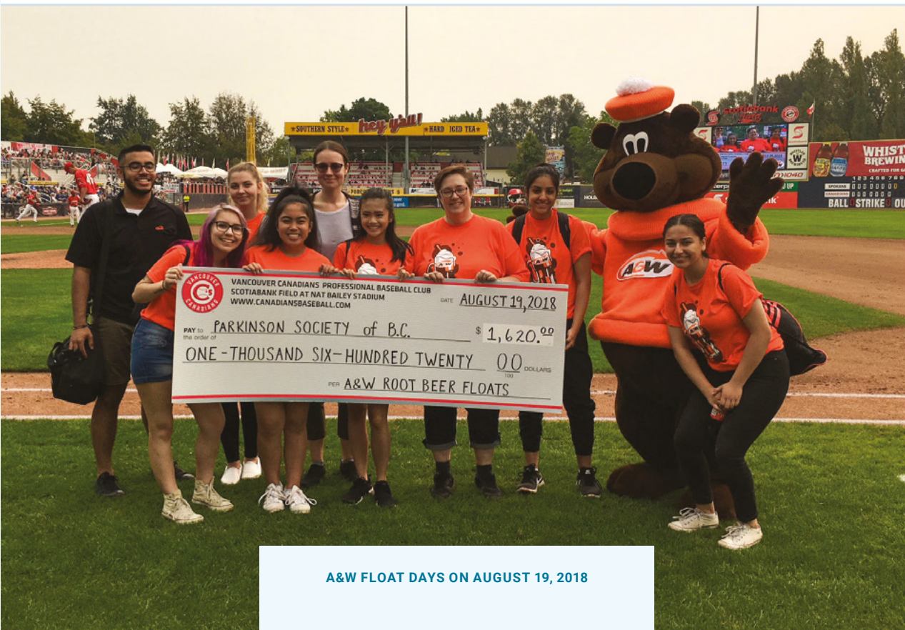
A&W FLOAT DAYS ON AUGUST 19, 2018

Raised by over 20 communities at Parkinson SuperWalk