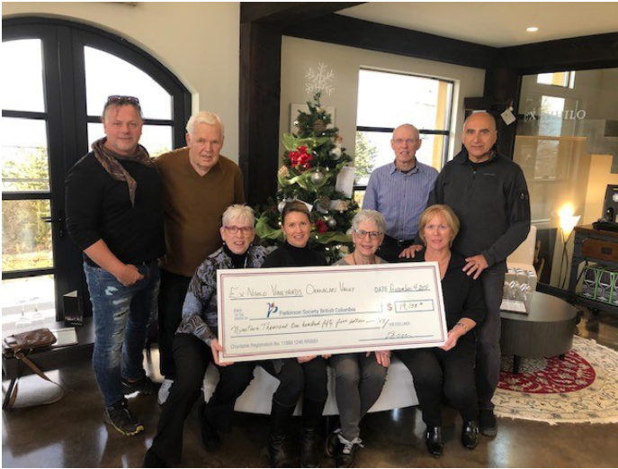
Ex Nihilo Vineyards cheque presentation with members of our Kelowna support group.

Do you like our new look? We're taking it online!