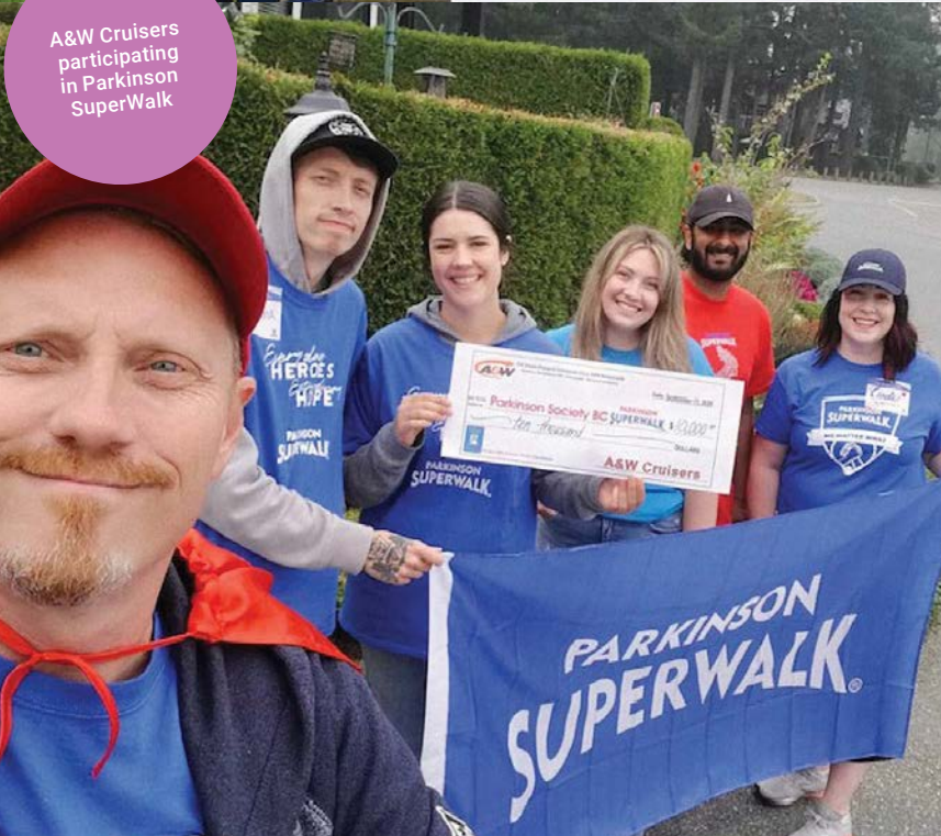
A&W Cruisers participating in Parkinson SuperWalk

Parkinson Society British Columbia Date: June 5, 2020 Pay to the order of: Parkinson Society British Columbia Amount: Five Hundred Thousand and 00/100 $500,000.00 Per: Fraternal Order of Eagles #2075 Charitable Registration No. 11880 1240 RR0001