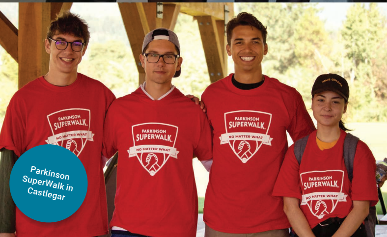
Parkinson SuperWalk in Castlegar