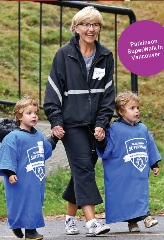
Parkinson SuperWalk in Vancouver