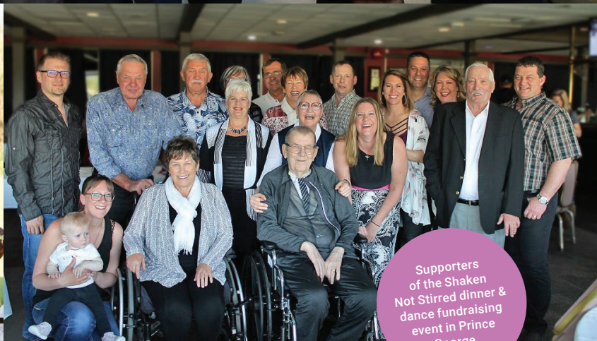
Supporters of the Shaken Not Stirred dinner & dance fundraising event in Prince George