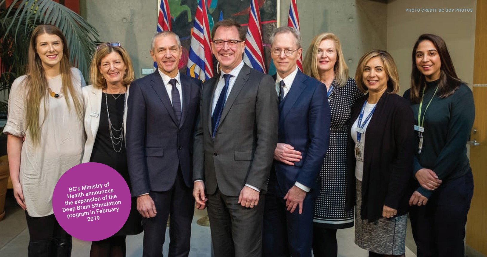
BC's Ministry of Health announces the expansion of the Deep Brain Stimulation program in February 2019